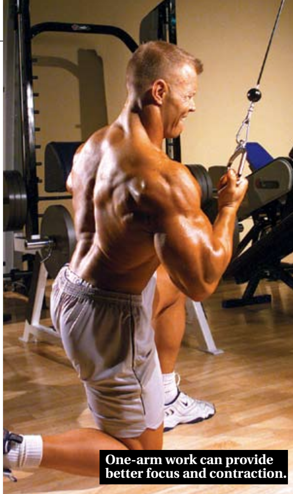
One-arm work can provide better focus and contraction.