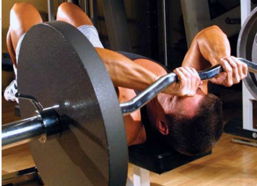
When performing lying extensions, you'll get a superior triceps contraction if you push the bar up and slightly back, away from your head.