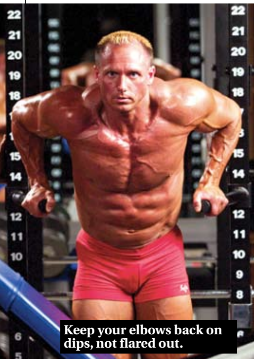
Keep your elbows back on dips, not flared out.