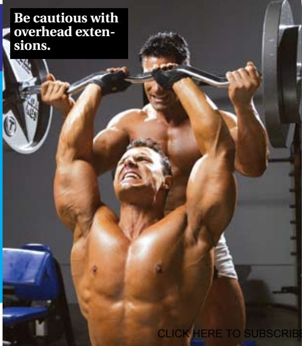
Be cautious with overhead extensions.