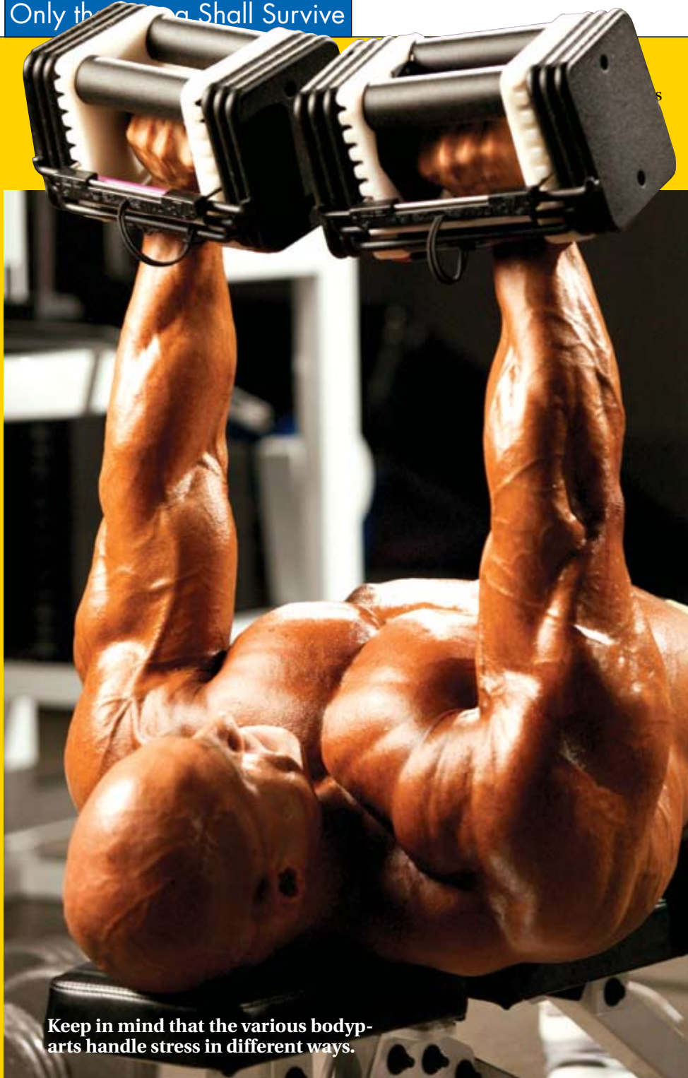
Keep in mind that the various bodyparts handle stress in different ways.